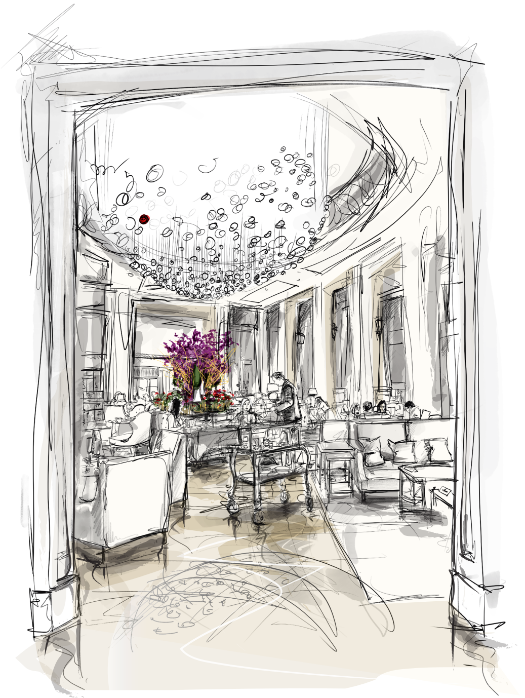
AFTERNOON TEA AT THE CRYSTAL MOON LOUNGE